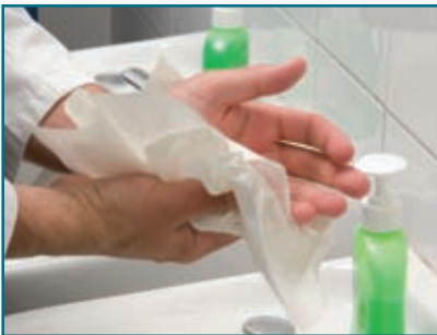
Dry hands thoroughly (front, back and between fingers).