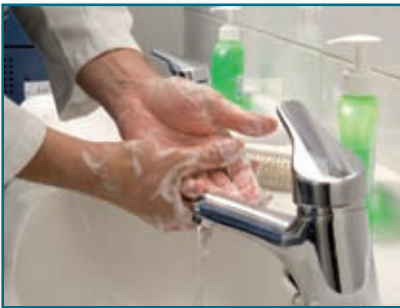
Wash hands with warm running water and soap, rubbing vigorously (front, back and between fingers).