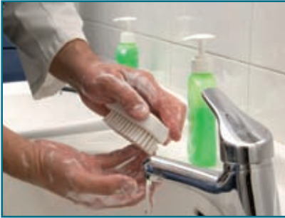
Clean under each fingernail using warm running water, soap and a nail brush.

However, none of those observed were given full marks as they all fell well short of ideal. Thorough washing and drying of hands is the most effective way of preventing the spread of infectious diseases.