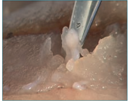
Fish containing parasites

If you catch a fish which appears skinny or in poor condition it may be due to disease or parasites. The best thing to do is throw it back.